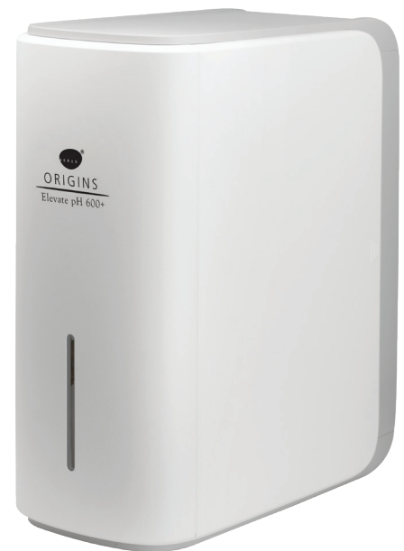
Includes dedicated 3.2 gallon tank and all hardware. Faucet sold separately.

Superior filtration and design puts clear, fresh, great tasting water right at your fingertips. No more guessing what's in your water. Reverse Osmosis works to remove dissolved substances from your water. RO is capable of rejecting: salts, sugars, proteins, dyes, particles, heavy metals, dissolved organics, and disinfectant byproducts. The water is then enhanced by our pH our "Elevate pH filter" leaving your water perfectly balanced for enhanced hydration.