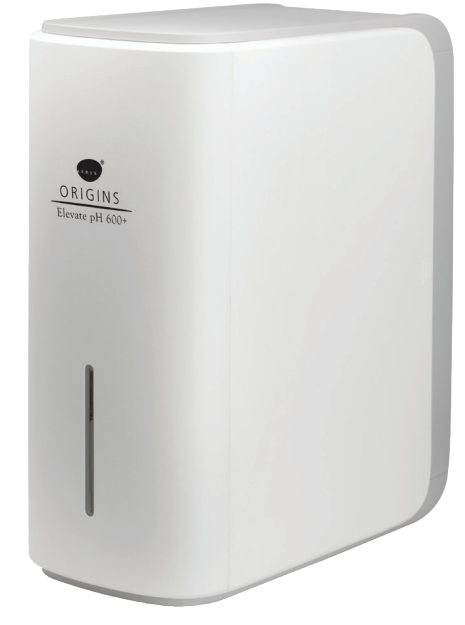
Includes dedicated 3.2 gallon tank and all hardware. Faucet sold separately.

With 6 total treatment stages and 4 stages of advanced filtration, the Aerus Elevate pH 600+ elevates the world of Reverse Osmosis by reintroducing minerals to the water enhancing the overall functionality by increasing the pH. The water first enters a Sediment Filter, then through a (2) Activated Carbon Filter before entering a (3) coconut granulated carbon filter. This enhanced carbon treatment protects a 250 gallon per day NSF approved Reverse Osmosis (RO) Membrane which removes virtually all impurities from the water. The final 2 stages of elevated enhancement introduce our Proprietary pH-enhancing Filter Technology, which is then refined one last time by our Polishing Filter. The result is water that is perfectly balanced and mineralized for enhanced hydration.